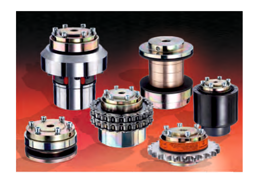
Torque Limiting Couplings