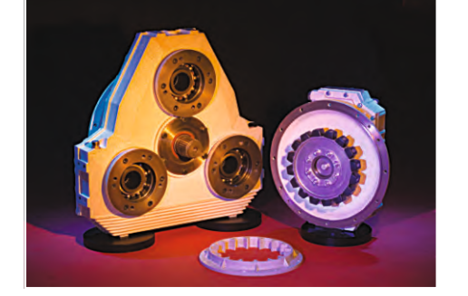
Multiple PTOs/Splitter Gearboxes