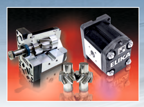
Low Noise Helical Gear Pumps