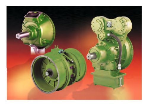
Hydraulic Power Take-off Units