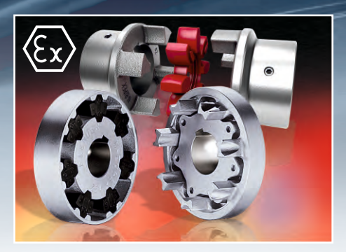
Torsionally Flexible Couplings