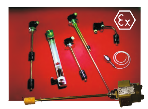
Flame Proof Option Level Indicators