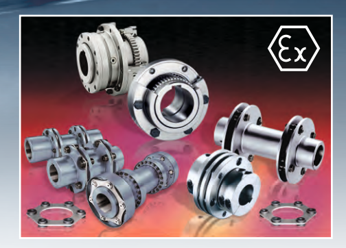
Torsionally Rigid Couplings