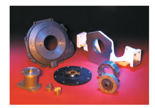
Engine Adaptor Kits