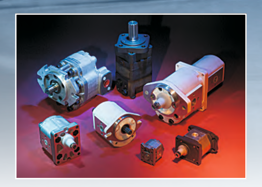
Gear Pumps/Gear Motors