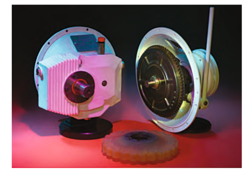
BD Clutches & Gearboxes