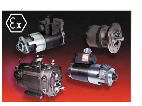
Pneumatic Starters & Motors