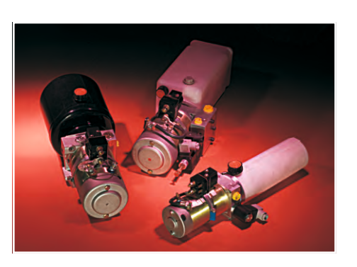
Mini Power Packs