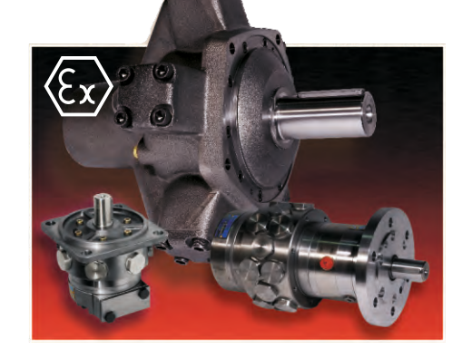
LSHT Motors/Hydraulic Geared Motors