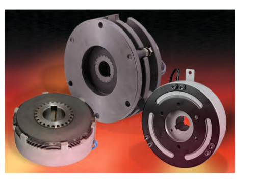
Electromagnetic Clutches & Brakes