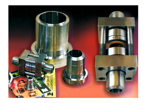
Quick Maintenance 'QM' Flange