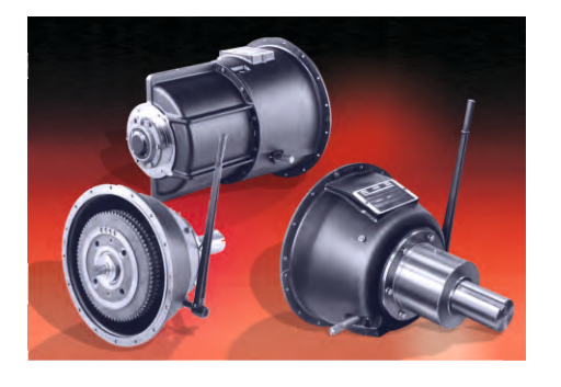
Mechanical Power Take-off Units