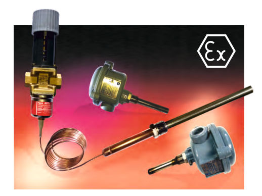
Thermostatic Valves & Controls